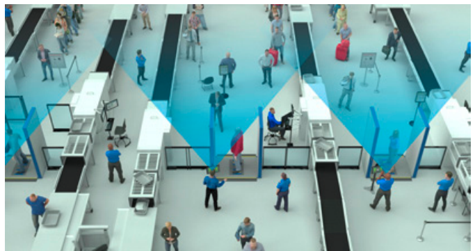
The open design of the R&S®QPS provides an unobstructed view of security screening operations

The system's compact footprint and high-speed scanning deliver rapid and high-volume screening to reduce queues and wait times. When operating an R&S®QPS scanner with multiple resolution stations, a single system is able to process more than 900 individuals per hour.