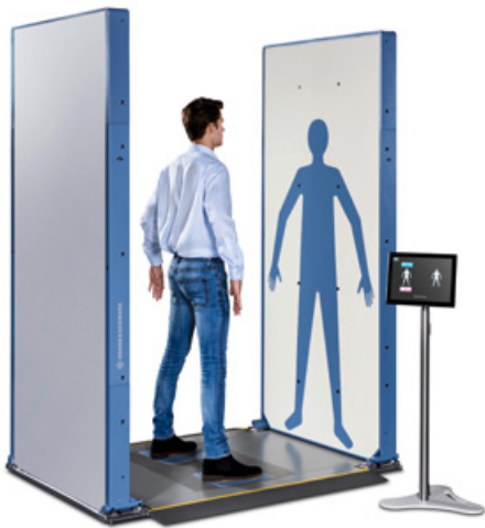
The R&S®QPS provides a compact and open footprint, while delivering unmatched detection of concealed threats and contraband

The R&S®QPS quick personnel security scanner transforms people screening technology with its high-performance, fully electronic and solid-state flat panel design that has no moving parts. The R&S®QPS improves the security screening experience and operations by having a simple open design for a spacious screening environment and unobstructed view for security personnel, making high-resolution people screening more comfortable and efficient than ever before.