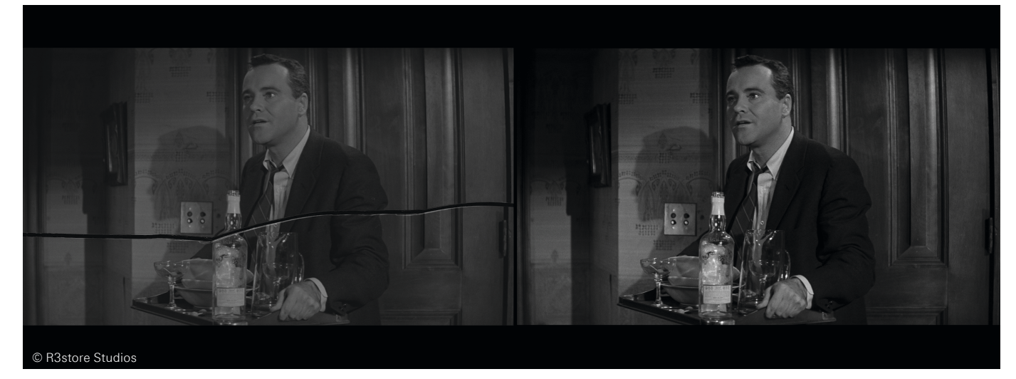
Jack Lemmon in "The Apartment", cropped and restored picture