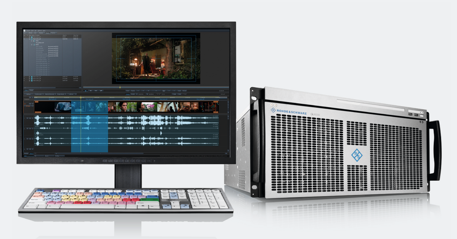
R&S°CLIPSTER is the gold standard solution for mastering and distribution of feature films and episodic TV. It is a powerful tool for editing any type of media, in any resolution, and creating a high-quality professional deliverable that meets stringent, professional delivery specifications. R&S°CLIPSTER is the foundation of choice for post-production vendors to build services upon.

Howard continues: "We will version the DCPs based on markets. For a big release you might have 120 shots that need localization and graphics work. This could include road signs that might be in a particular language that we have to change according to the territory, or a shot of a mobile phone with a vital text message on it that we