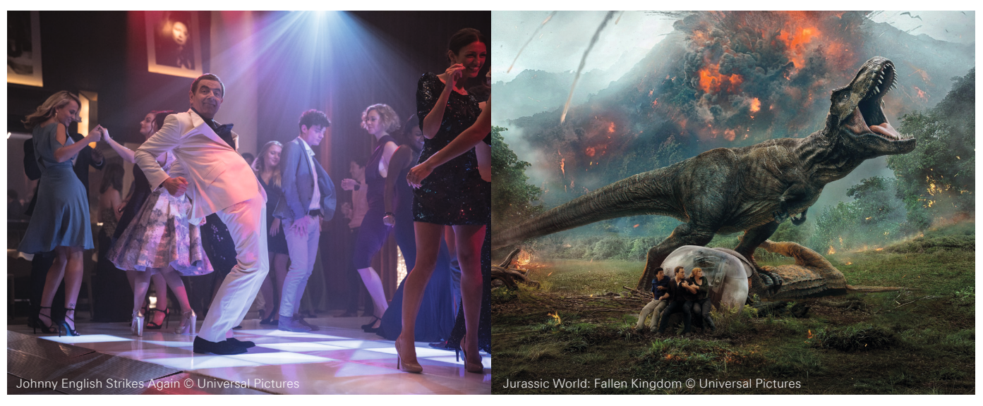
Scenes from two films that Motion Picture Solutions (MPS) has been working on with R&S°CLIPSTER