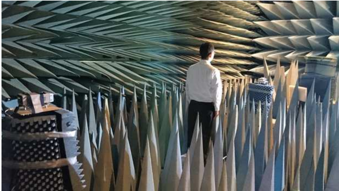
Fig. 1: Experimental setup in anechoic chamber.