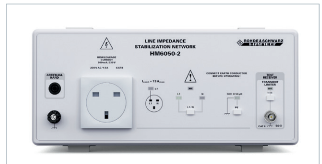
HM6050-2S: US Version